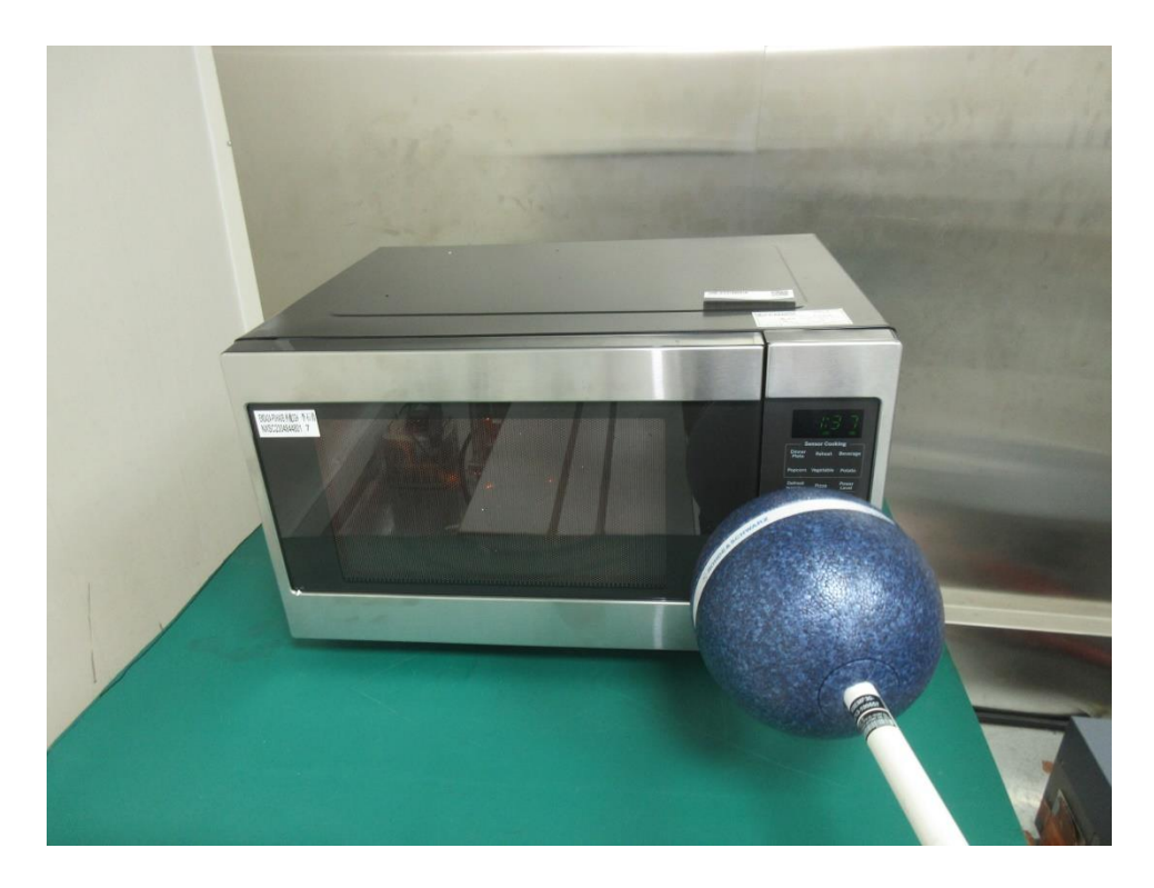
End of the report