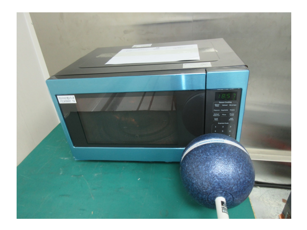
End of the report