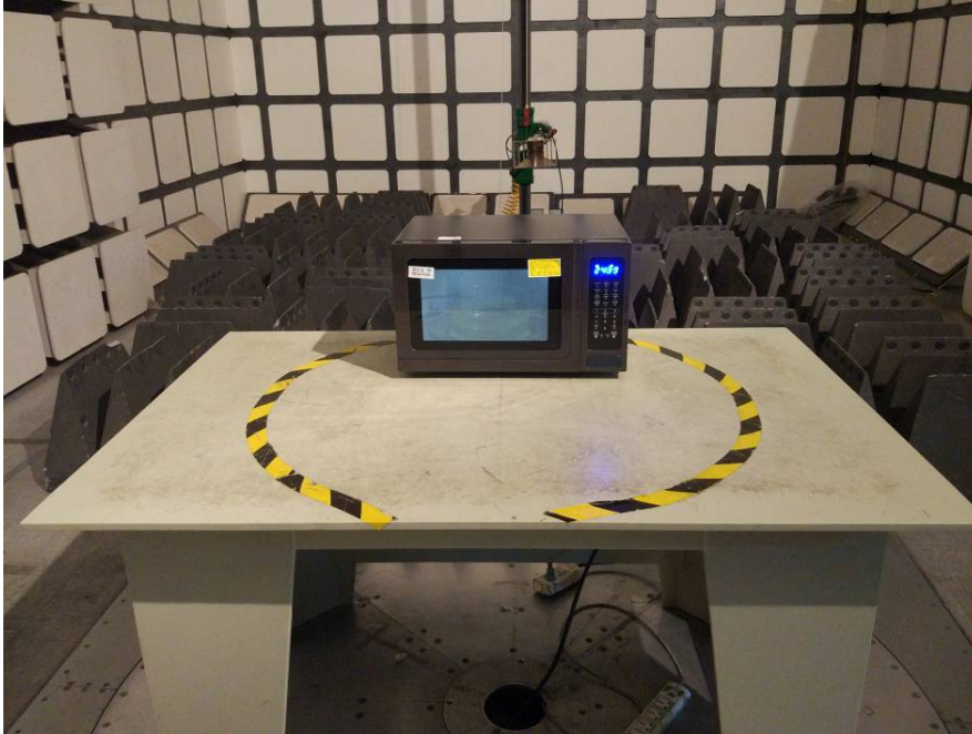
Radiated Emissions - Rear View (Above 1 GHz)