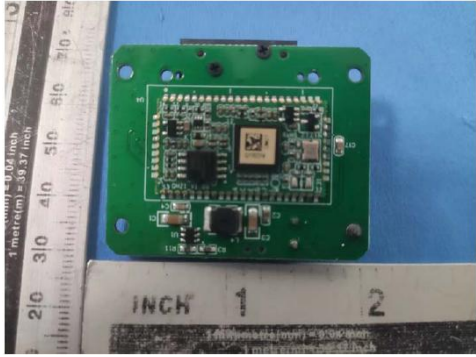
3. Adding alternative power supply board that combining KM60 transfer slab board into filter board The old: KM Transfer Slab Board