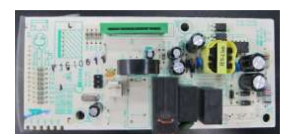
New Mother board -top view