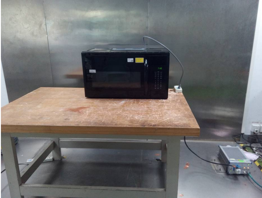
Conducted Emissions - Side View