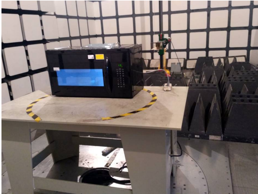
Radiated Emissions - Rear View (Above 1 GHz)