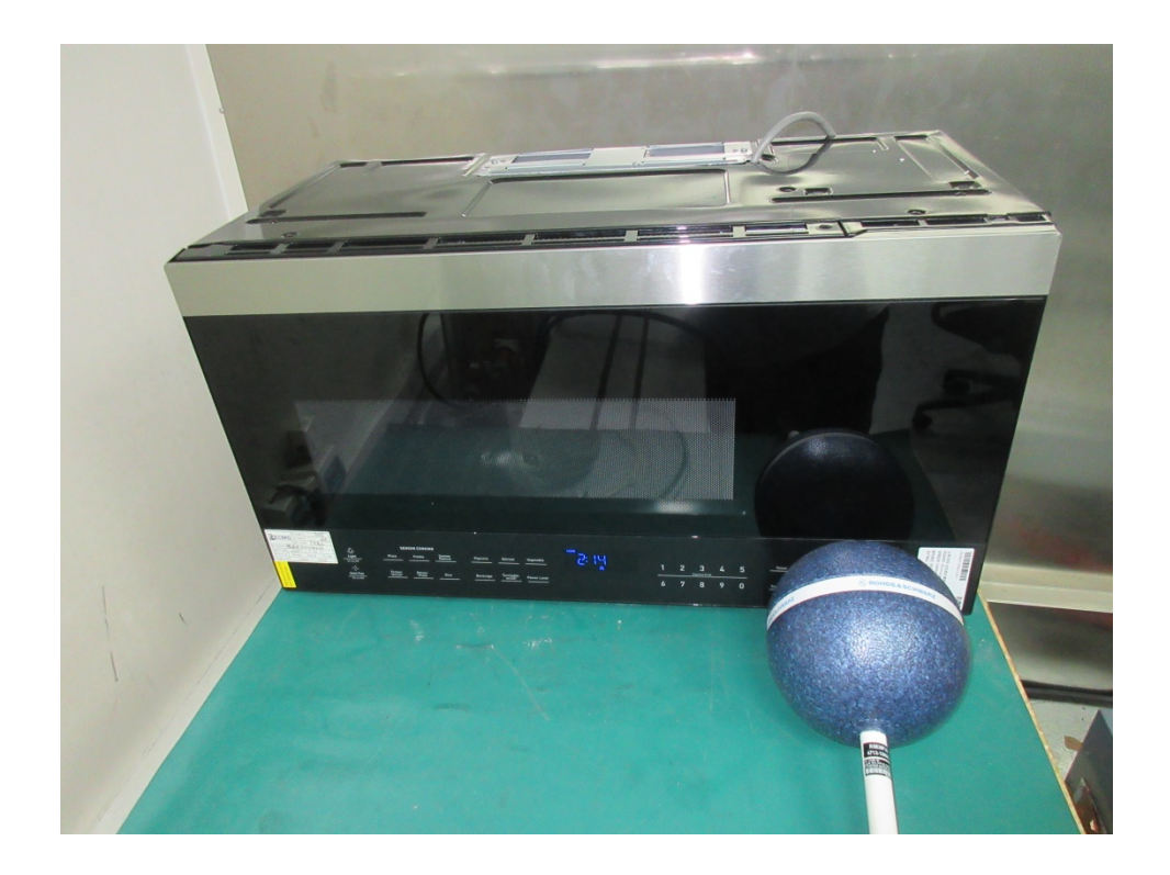
End of the report