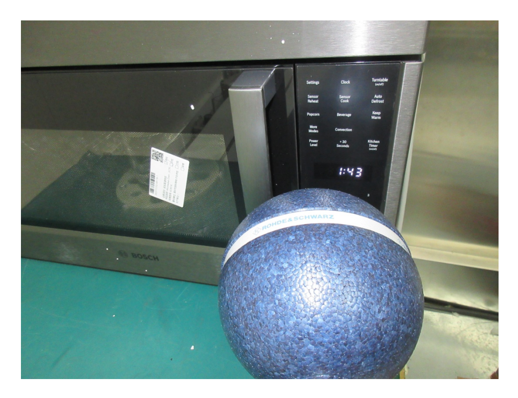
End of the report