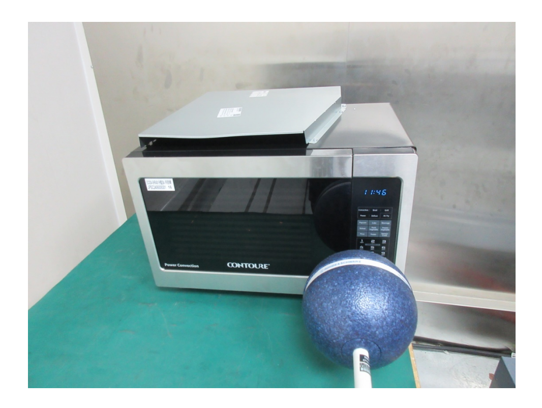
End of the report