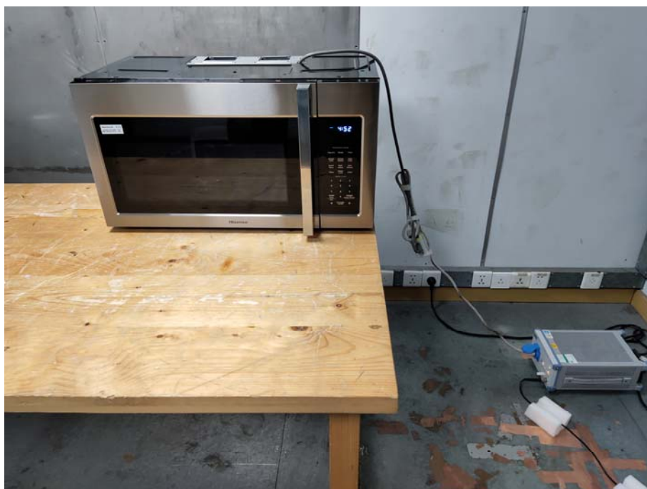
Photo of Power Line Conducted Emission Measurement