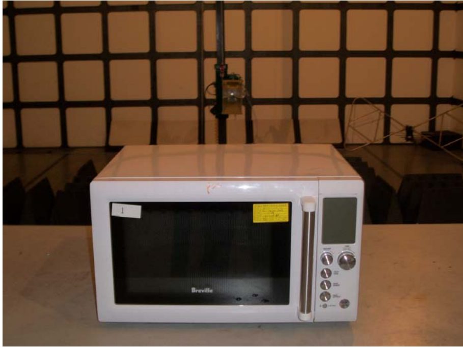
Radiated Emission Test Set-up (1-25GHz)