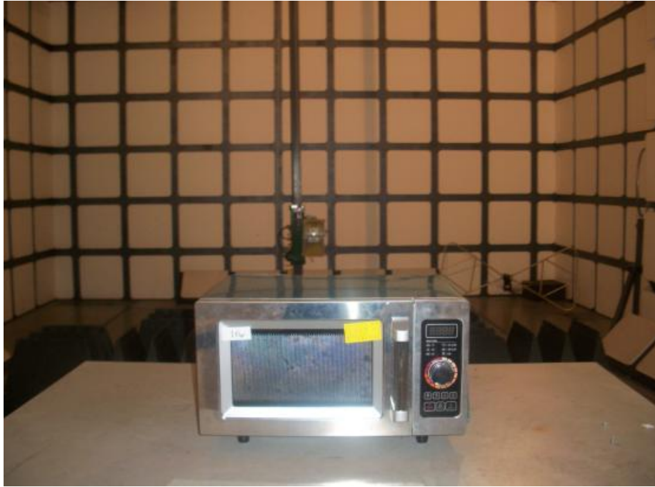
Radiated Emission Test Set-up (1-18GHz)