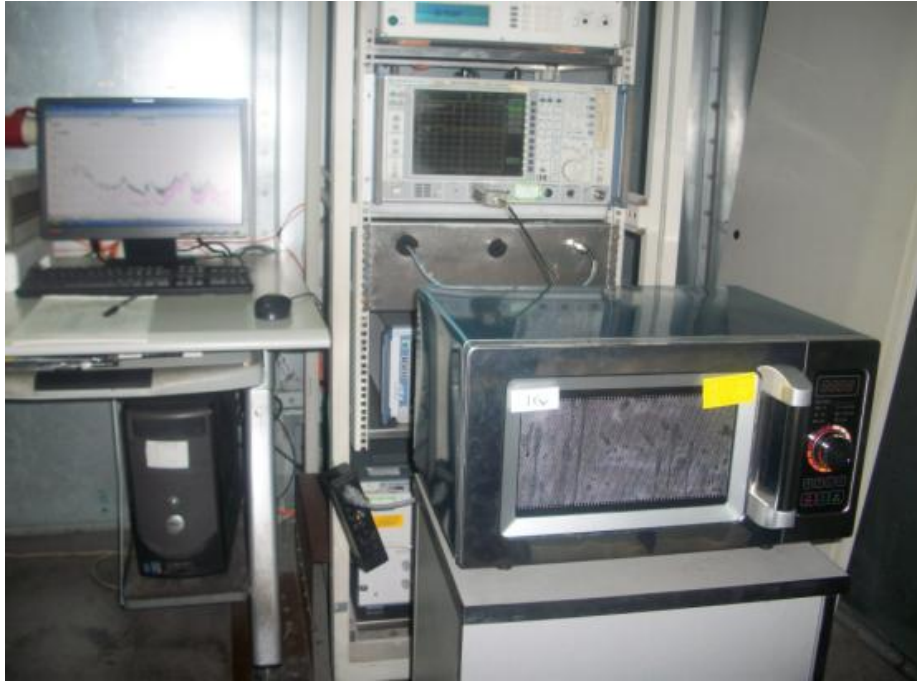
Conducted Emission Test Set-up