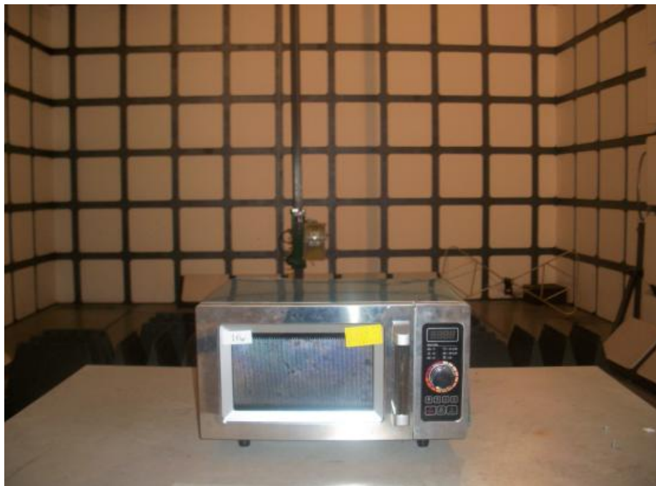
Operating Frequency Test Set-up