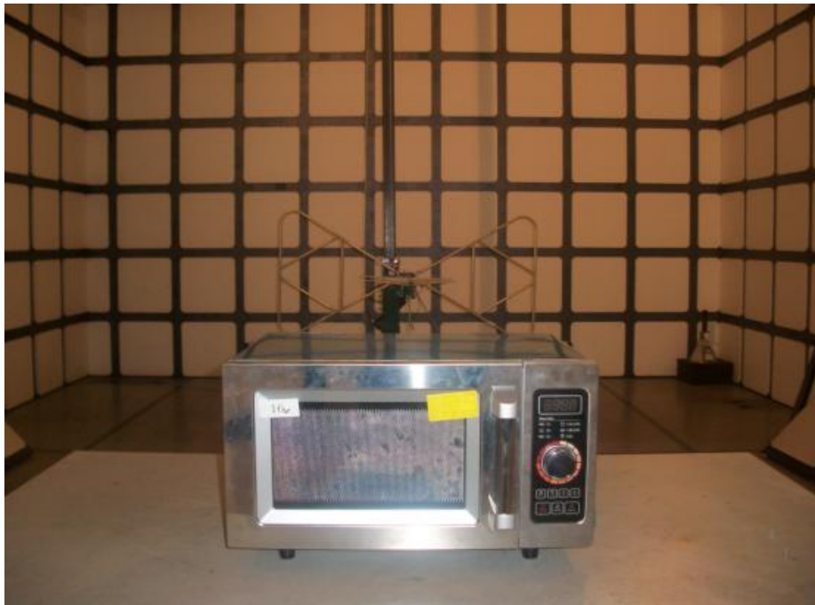
Radiated Emission Test Set-up (30 -1,000MHz)