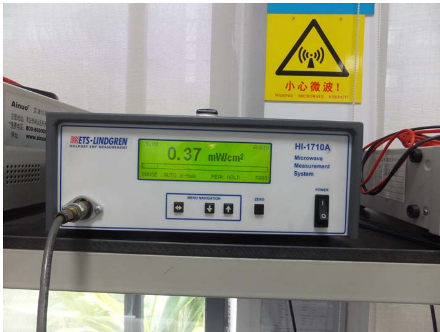
Radiation Hazard Test Set-up