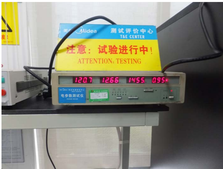
Input Power Test Set-Up