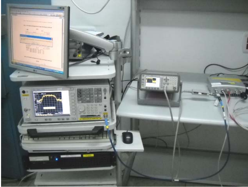
Photograph No.1 Peak output power measurement setup