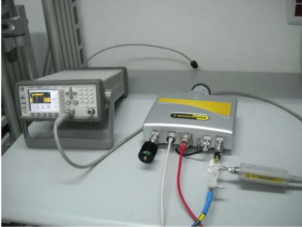
Photograph No.1 Peak output power measurement setup