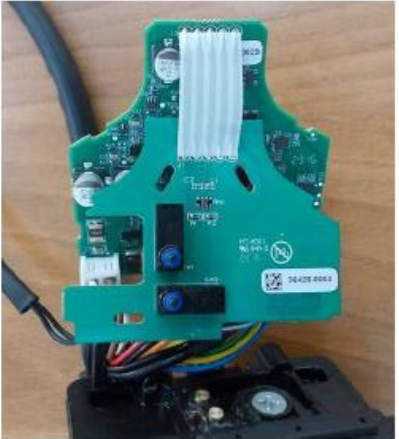
Figure 4 – Switch board Top side