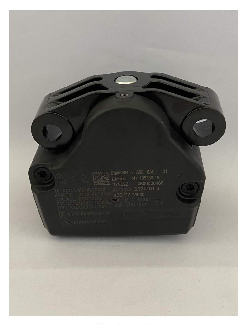
Position of the marking