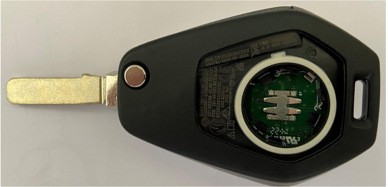
Position of the marking