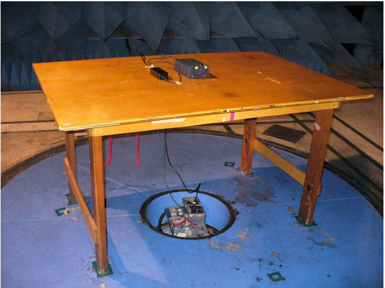
Figure 1: Radiated Emissions – Front View