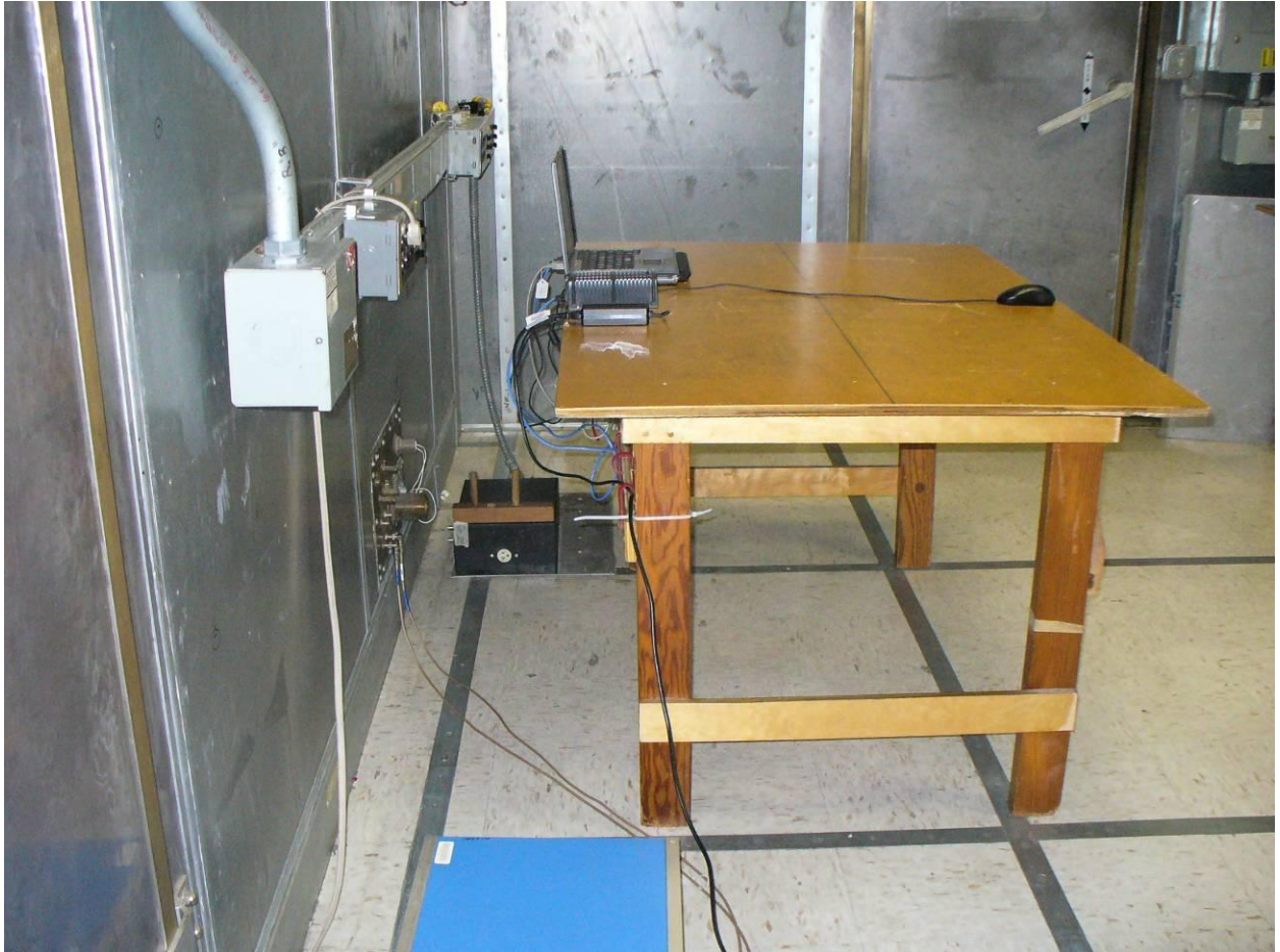
Figure 5: Power Line Conducted Emissions Side View