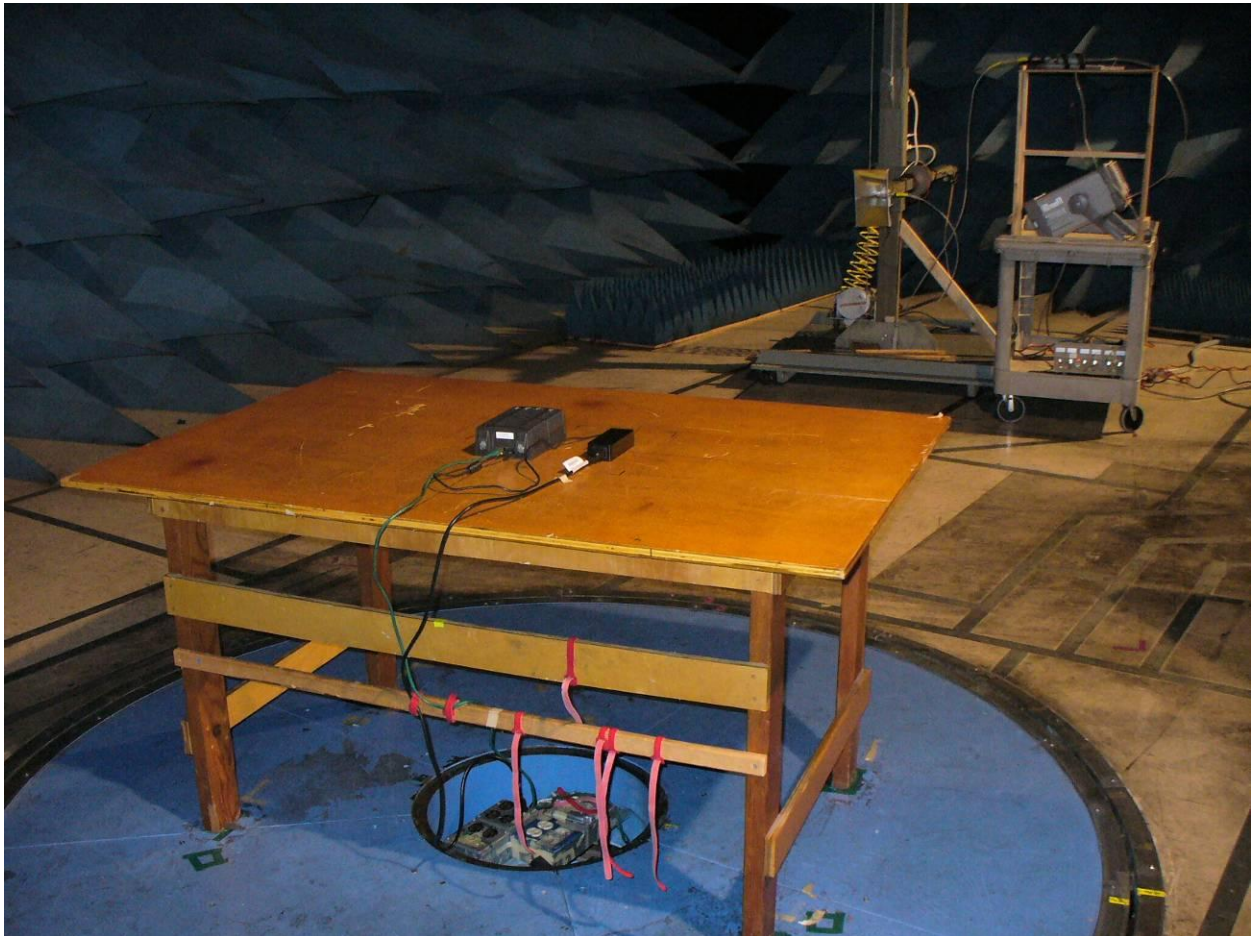
Figure 2: Radiated Emissions – Back View