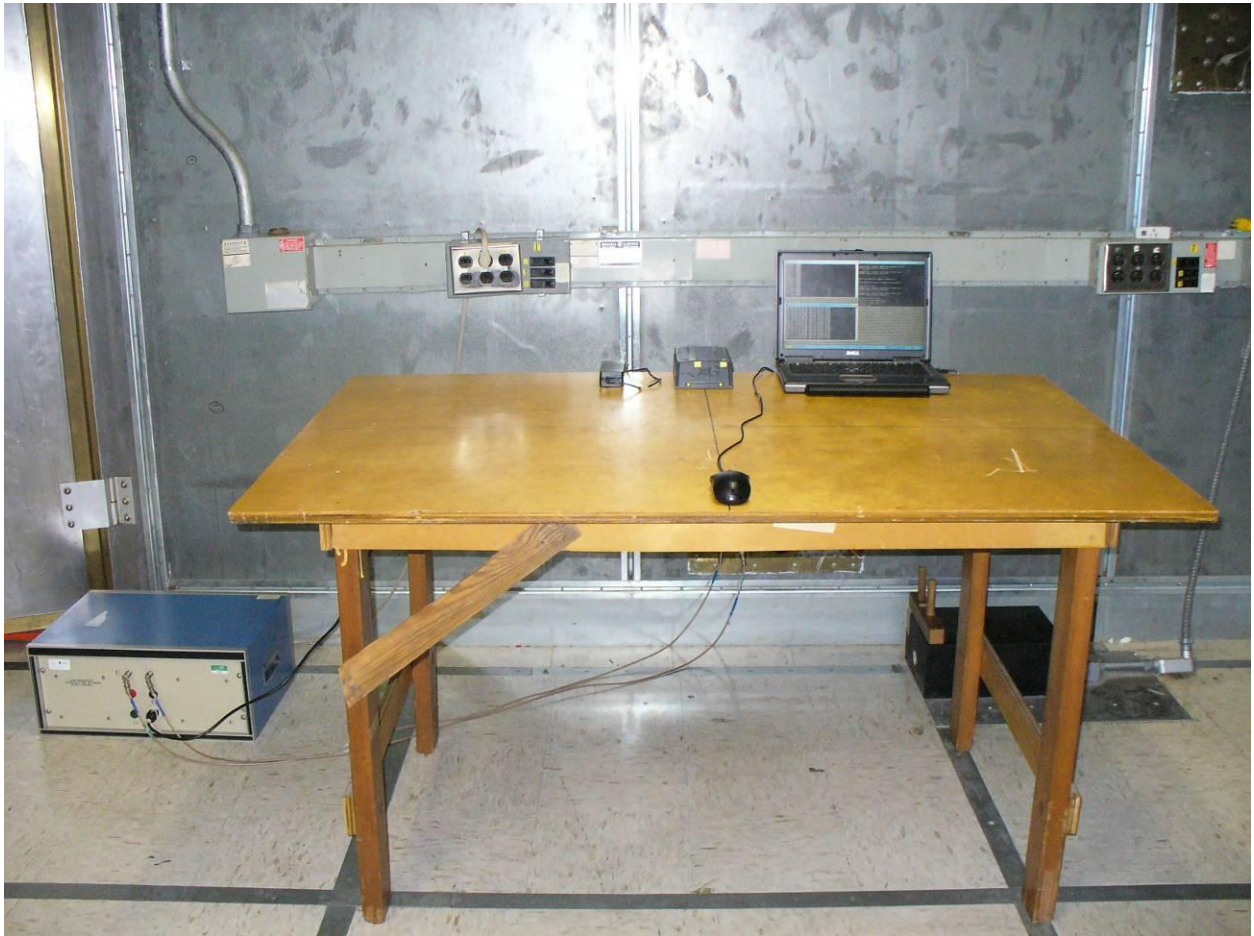
Figure 4: Power Line Conducted Emissions Front View