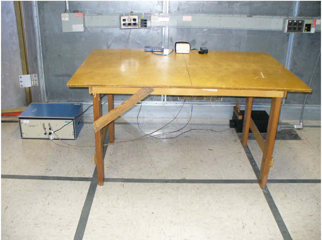
Figure 4: Power Line Conducted Emissions Front View