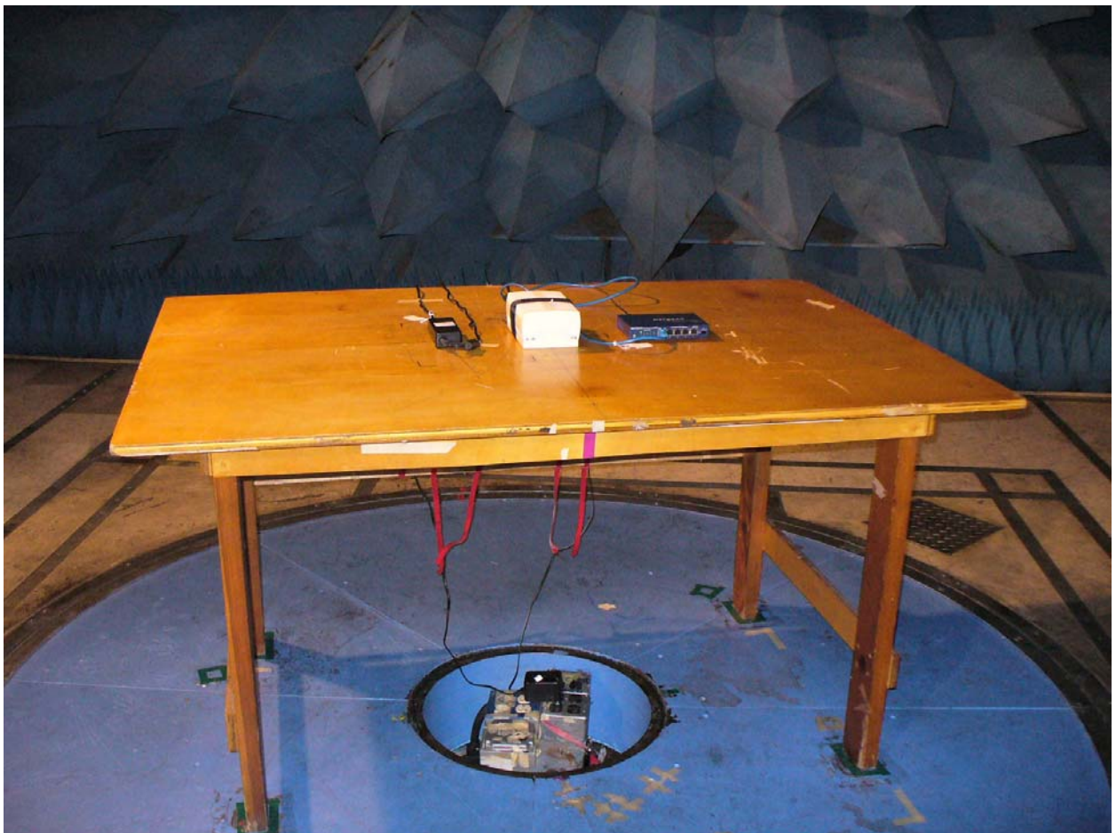
Figure 1: Radiated Emissions – Front View