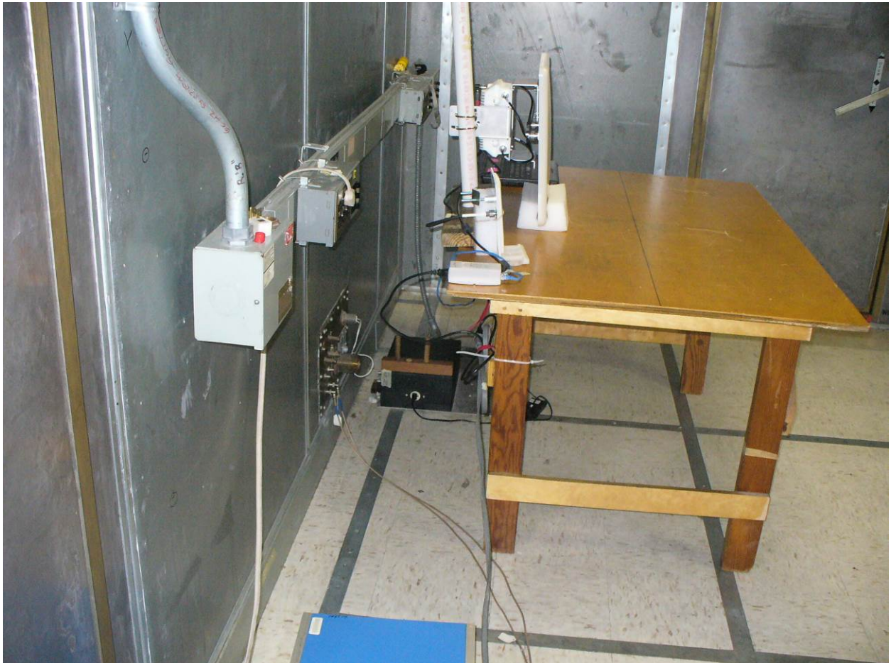
Figure 5: Power Line Conducted Emissions – Side View