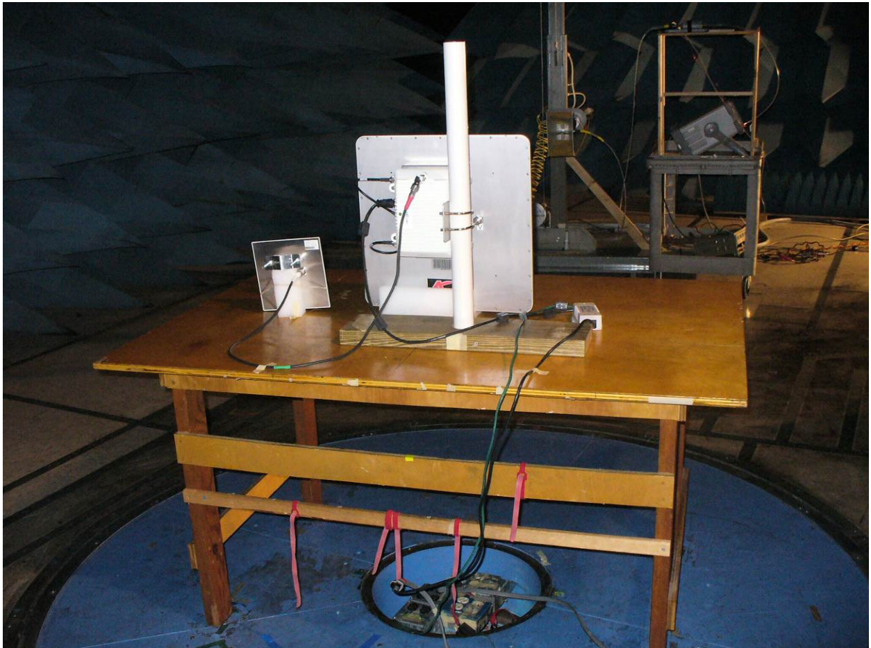
Figure 2: Radiated Emissions – Back View