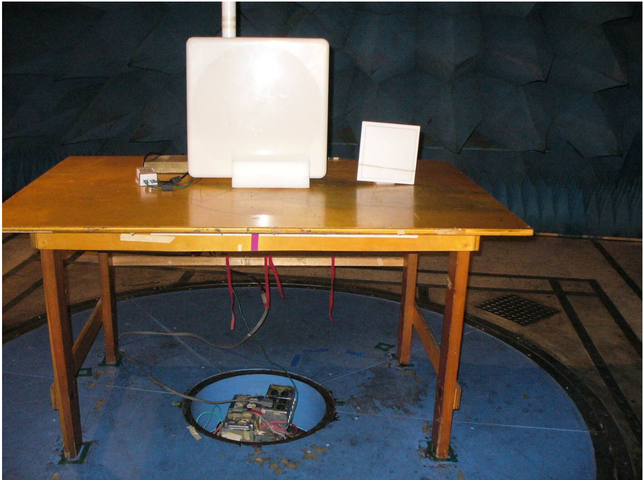
Figure 1: Radiated Emissions – Front View