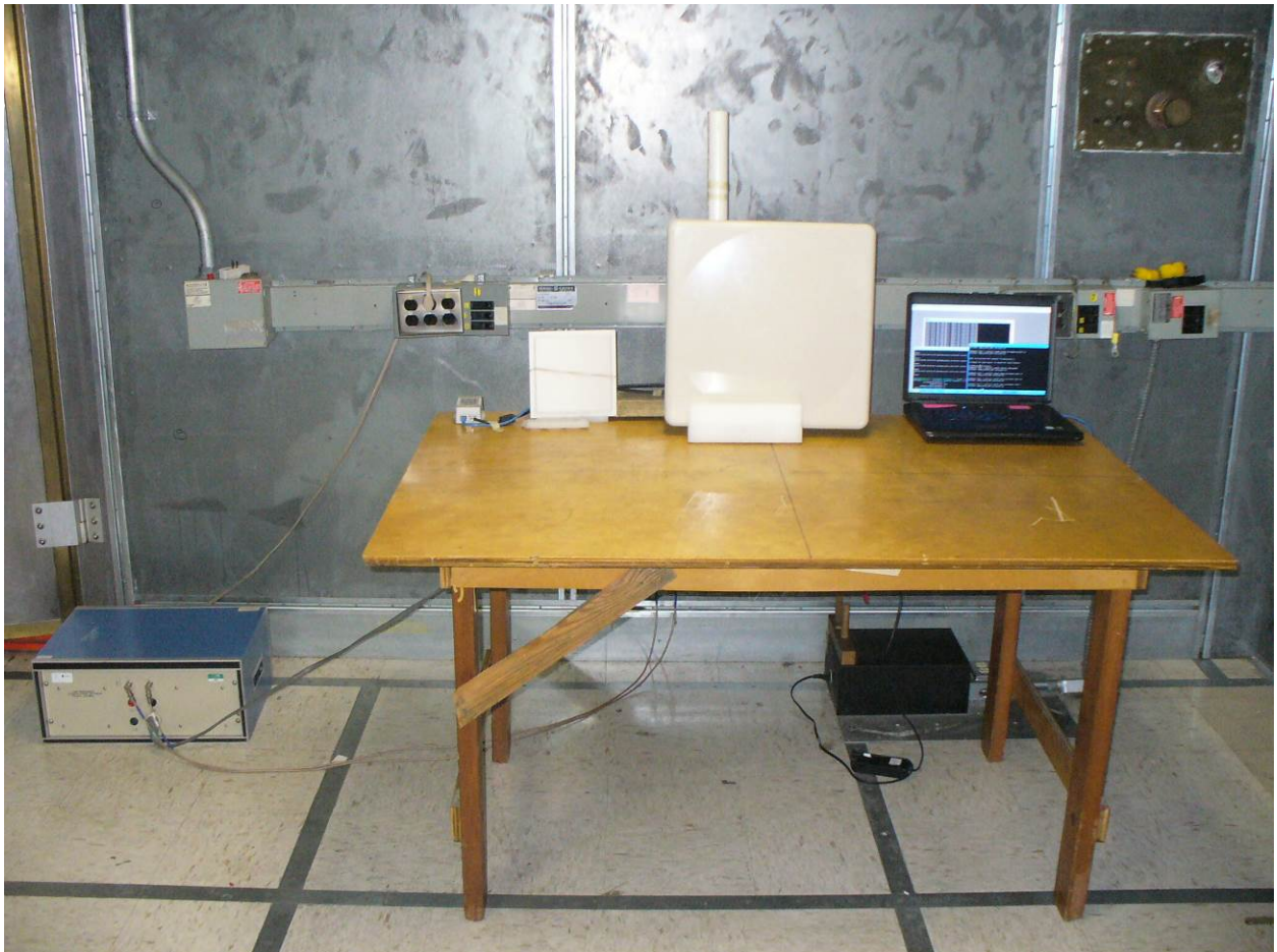
Figure 4: Power Line Conducted Emissions – Front View