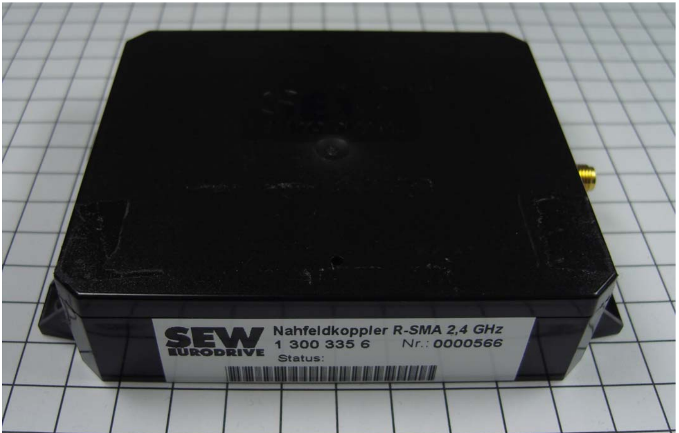
Antenna Nahfeldkoppler 2.4 GHz