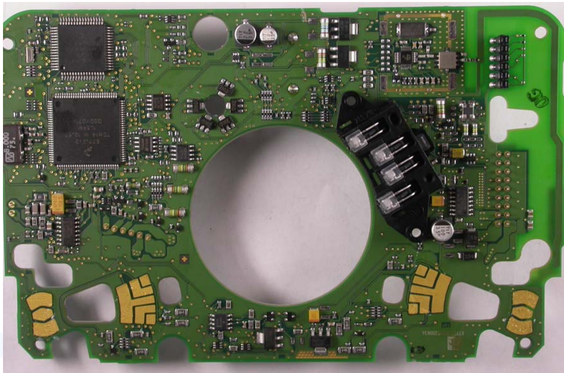
Internal Photo Front View PCB, detailed photo