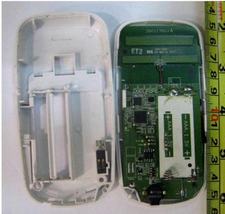
EUT Internal View