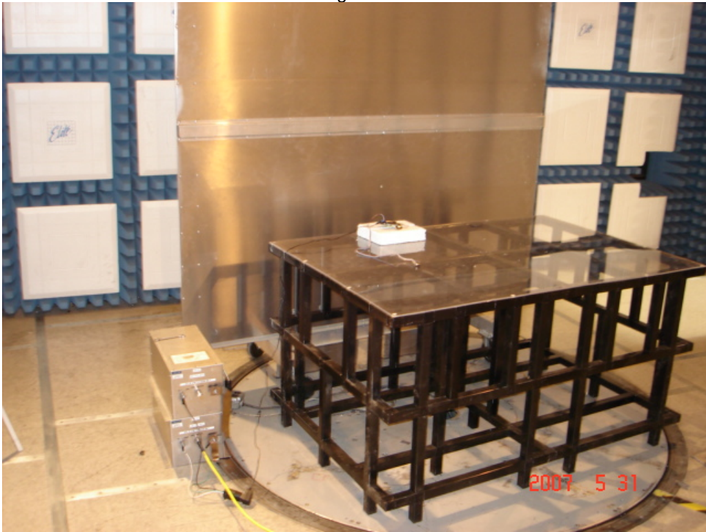
Test Set-up for Conducted Emissions