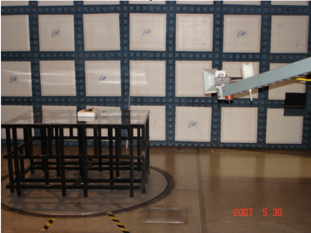
Test Set-up for Radiated Emissions, 2GHz to 18GHz – Horizontal Polarization