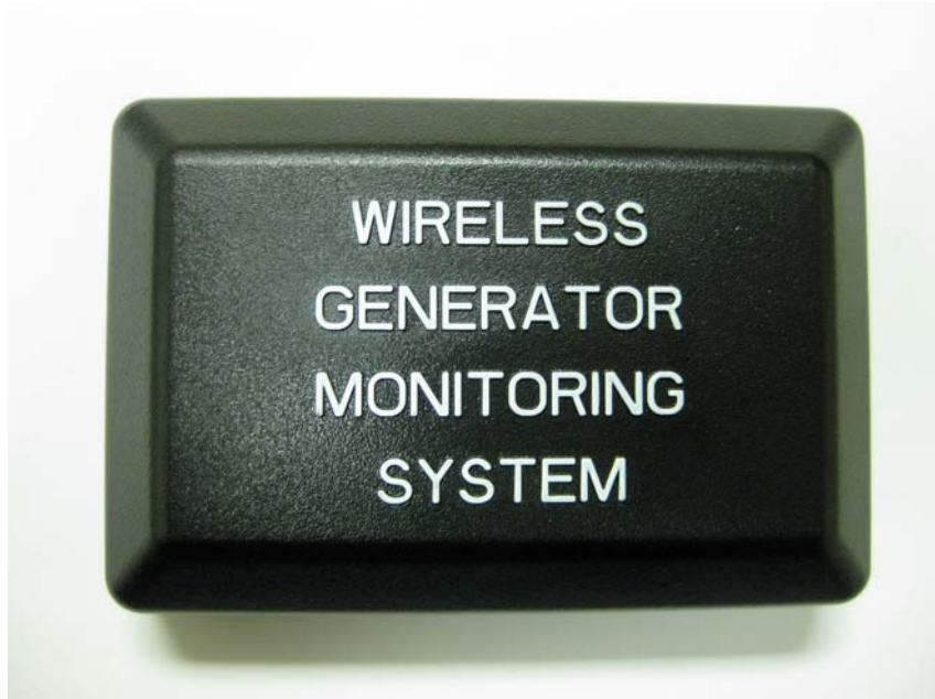
Top of Unit