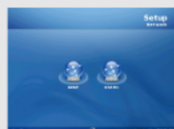
<Select DHCP or Static>

4 Enjoy the "Main Menu" 1) Photos : To enjoy the pictures and you can access to the "Yahoo Flickr & Google Picasa".