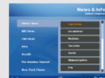
<News & Info>

5) News & Info : To check the Headline News of Yahoo, BBC, CNN, MSN, Health, The Weather Channel, and New York Times.