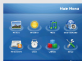
<Main Menu Screen>

2 Connect the Power Cable onto the Photo Frame. Booting will be automatically executed and "Main Menu" will be shown.