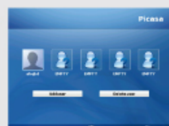
<flickr & picasa add>