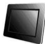
Digital Photo Frame