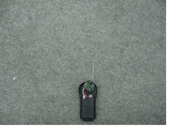
Inner Circuit Bottom View