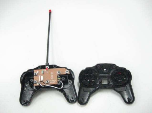
Front View of the product (Internal)