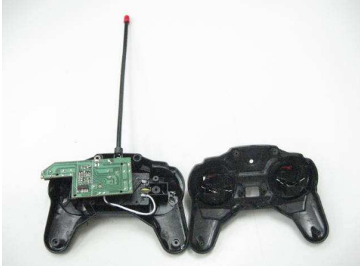
Rear View of the product (Internal)