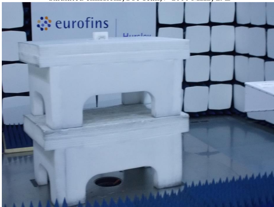
Radiated emissions, Pre-scan, > 1000 MHz; 29L