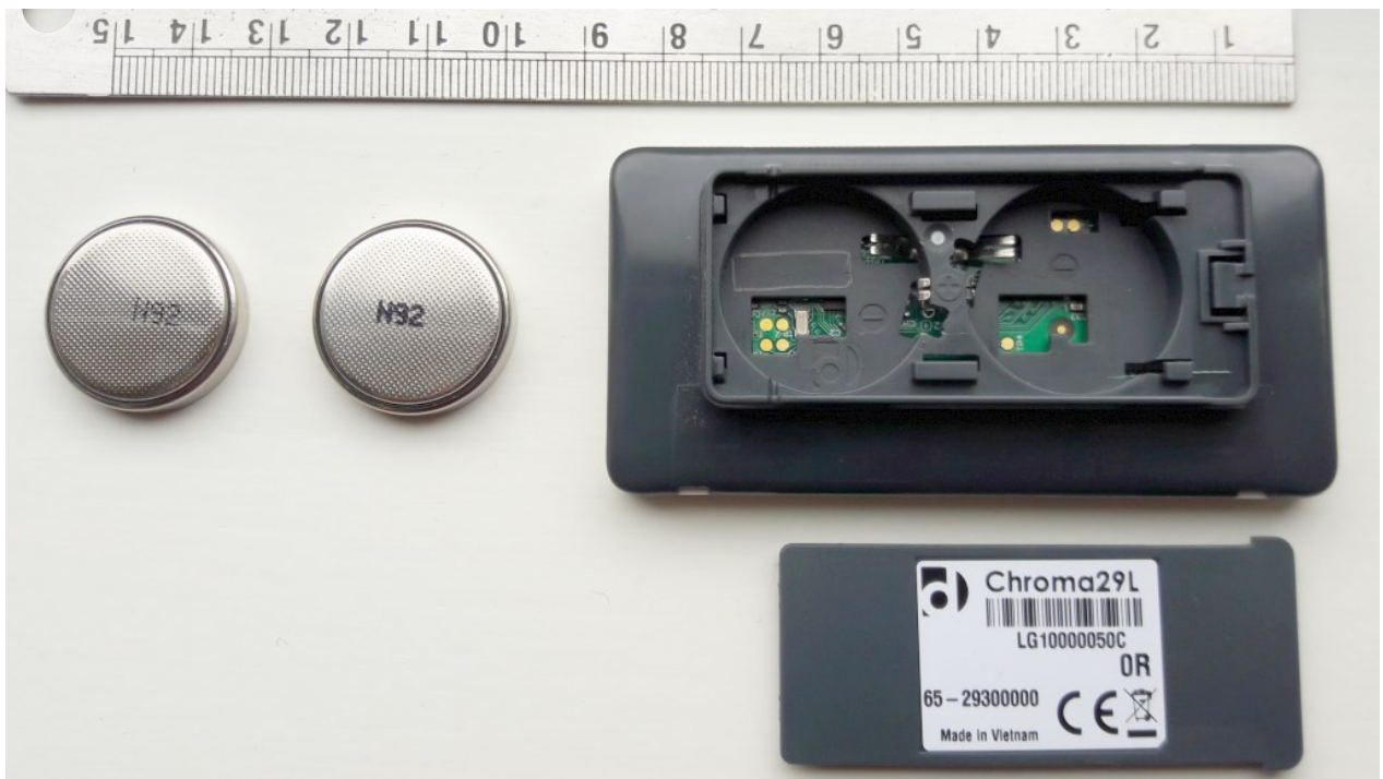
Battery Cover and 2 x CR2450 coin cells removed