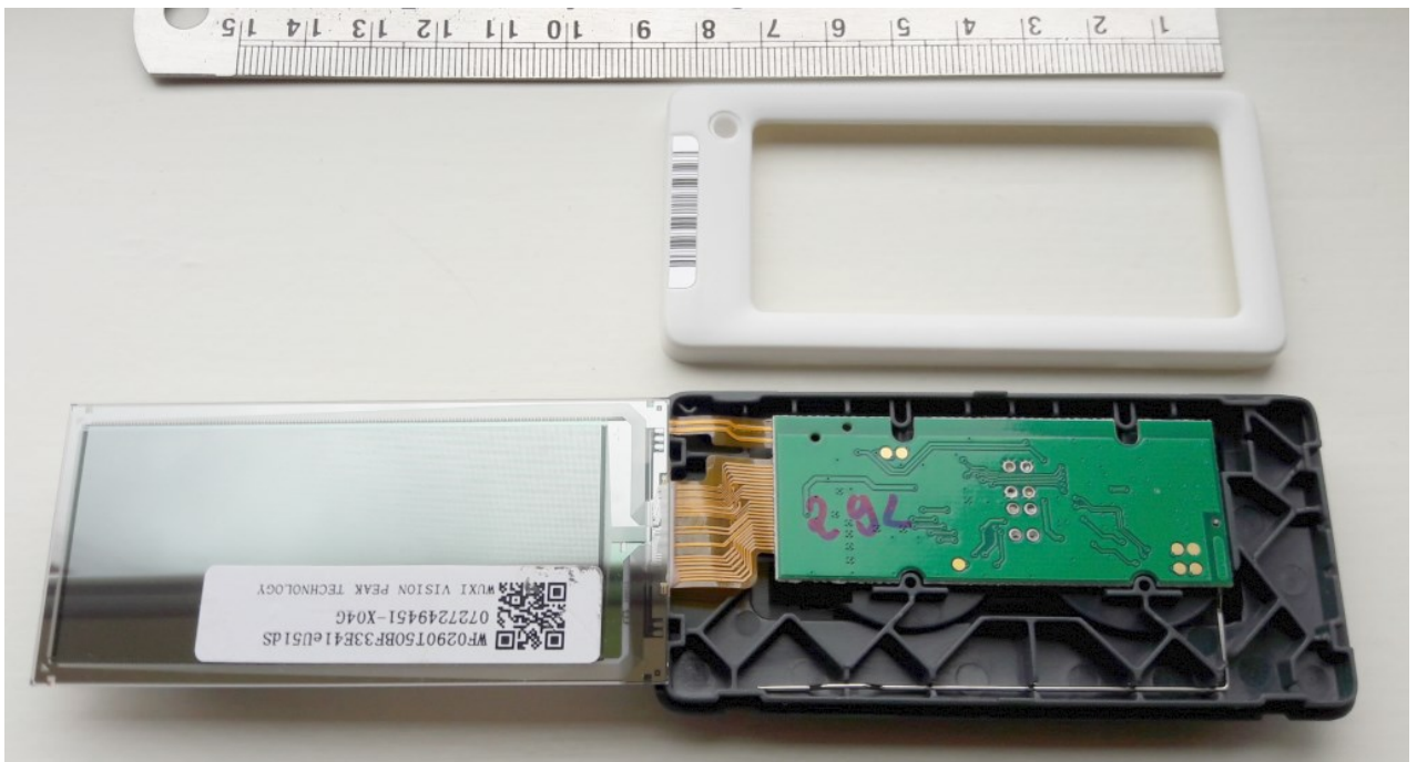
Front cover removed and display glass folded open