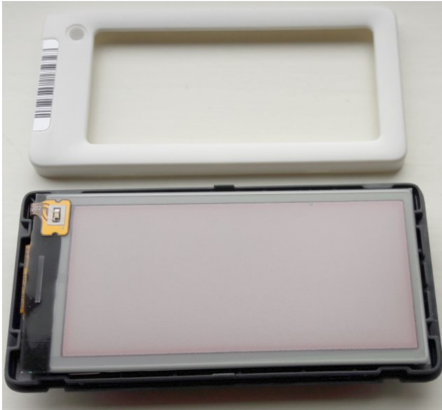
Front cover removed