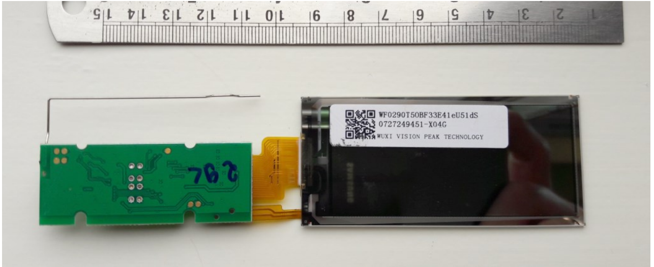
PCB and display glass rear side