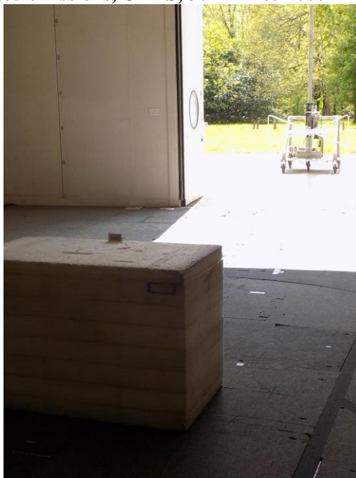
Radiated emissions, OATS, 30 MHz to 1000 MHz; 27L