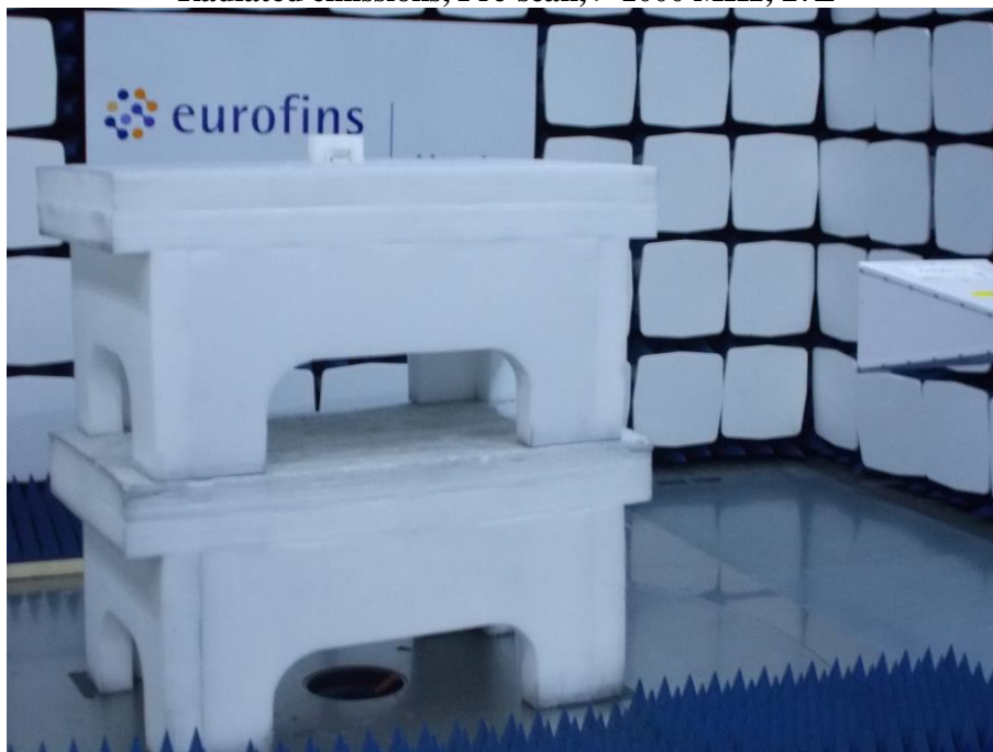
Radiated emissions, Pre-scan, > 1000 MHz; 27L