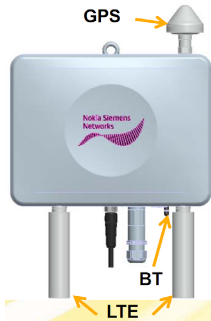
Figure 4-1 EUT: Omni configuration (1)