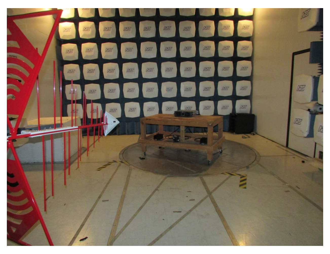
30-1000MHz Radiated Measurements