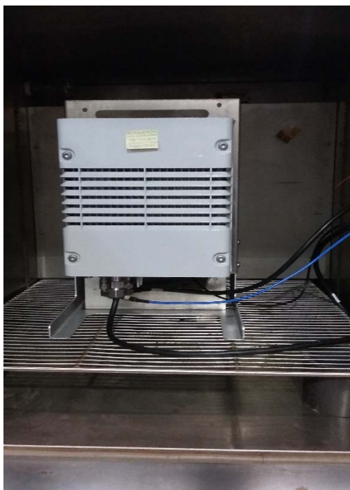
Frequency Stability Setup