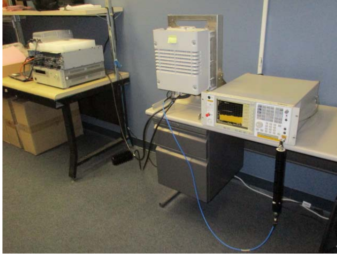
Conducted Port Testing