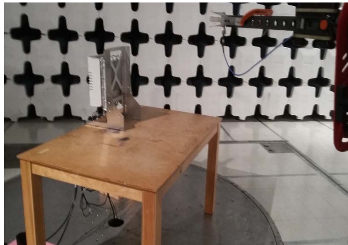
Radiated Spurious Emissions > 18GHz