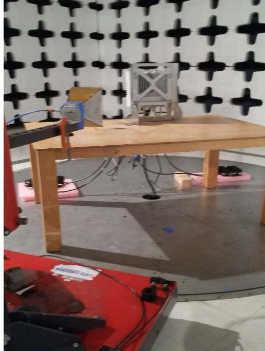
Radiated Spurious Emissions 1GHz > < 18GHz