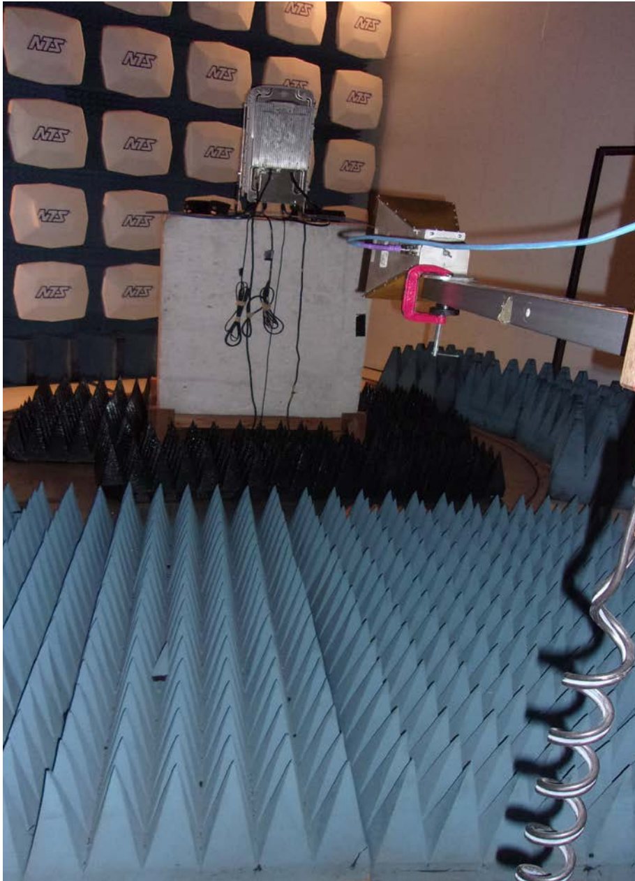
RE – 1-10GHz at 3m