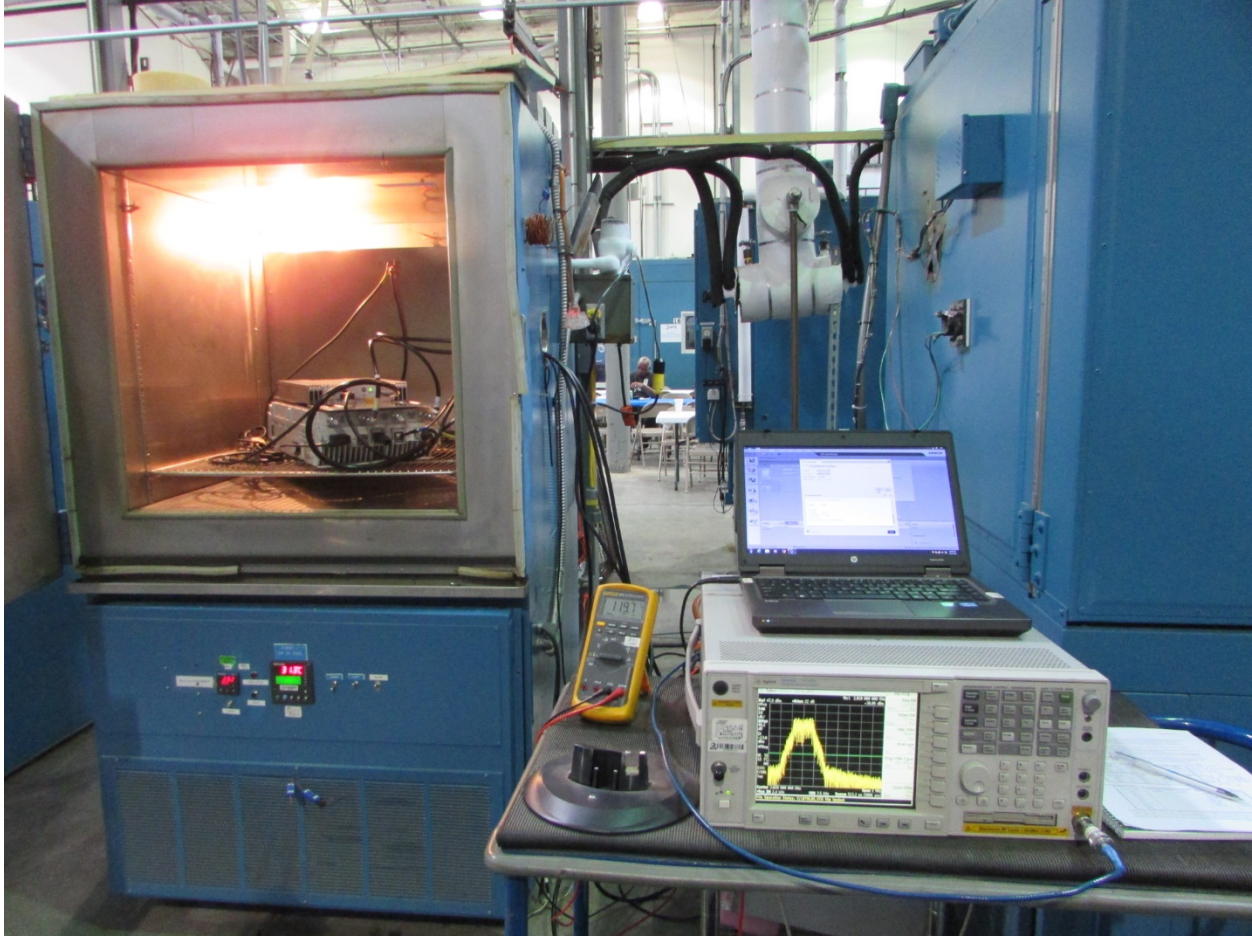
Frequency Stability AC Power Supply Module