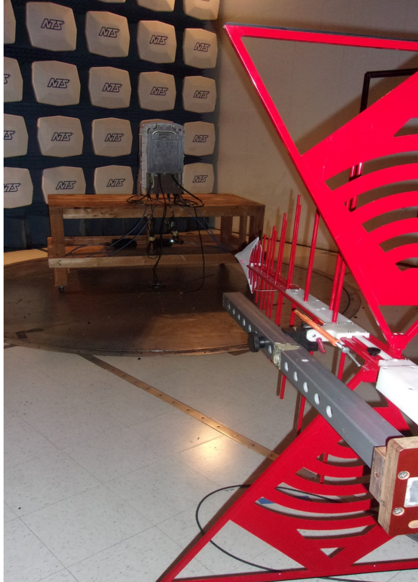
RE – 30-1000MHz at 3m