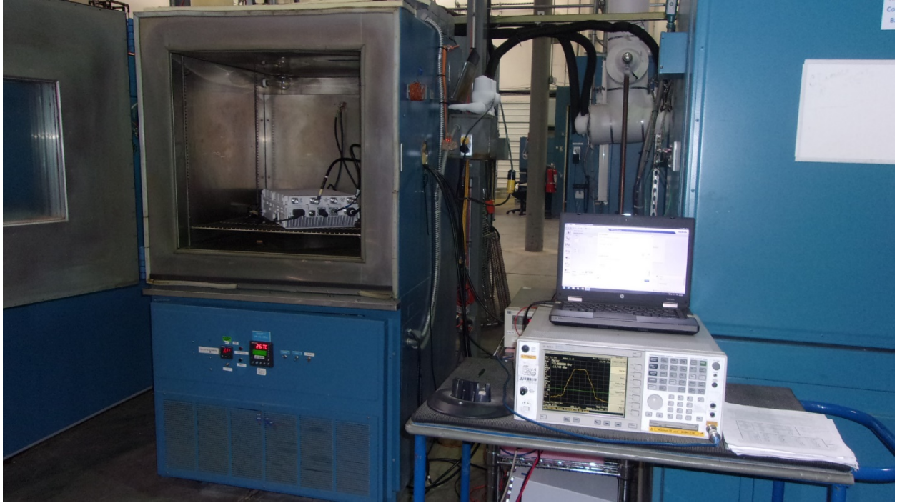
Frequency Stability DC Power Supply