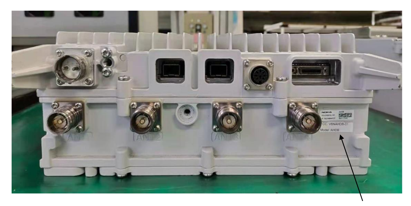
FCC Label for AHDB