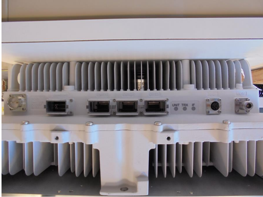
Bottom View Showing I/O Connectors