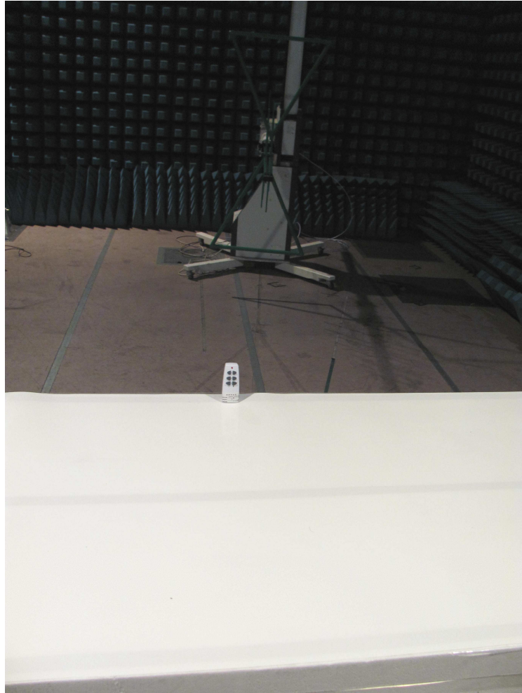
30MHz-1000MHz, Z axis