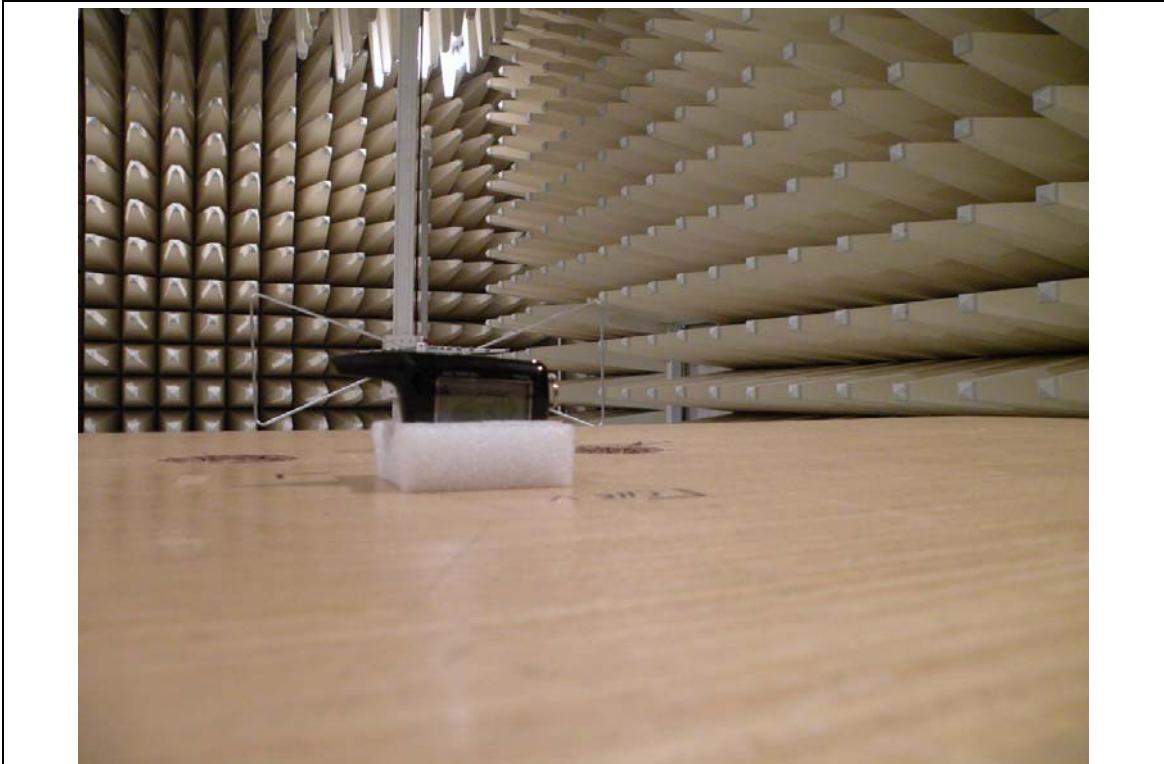
< Y-axis Radiated emission Test >