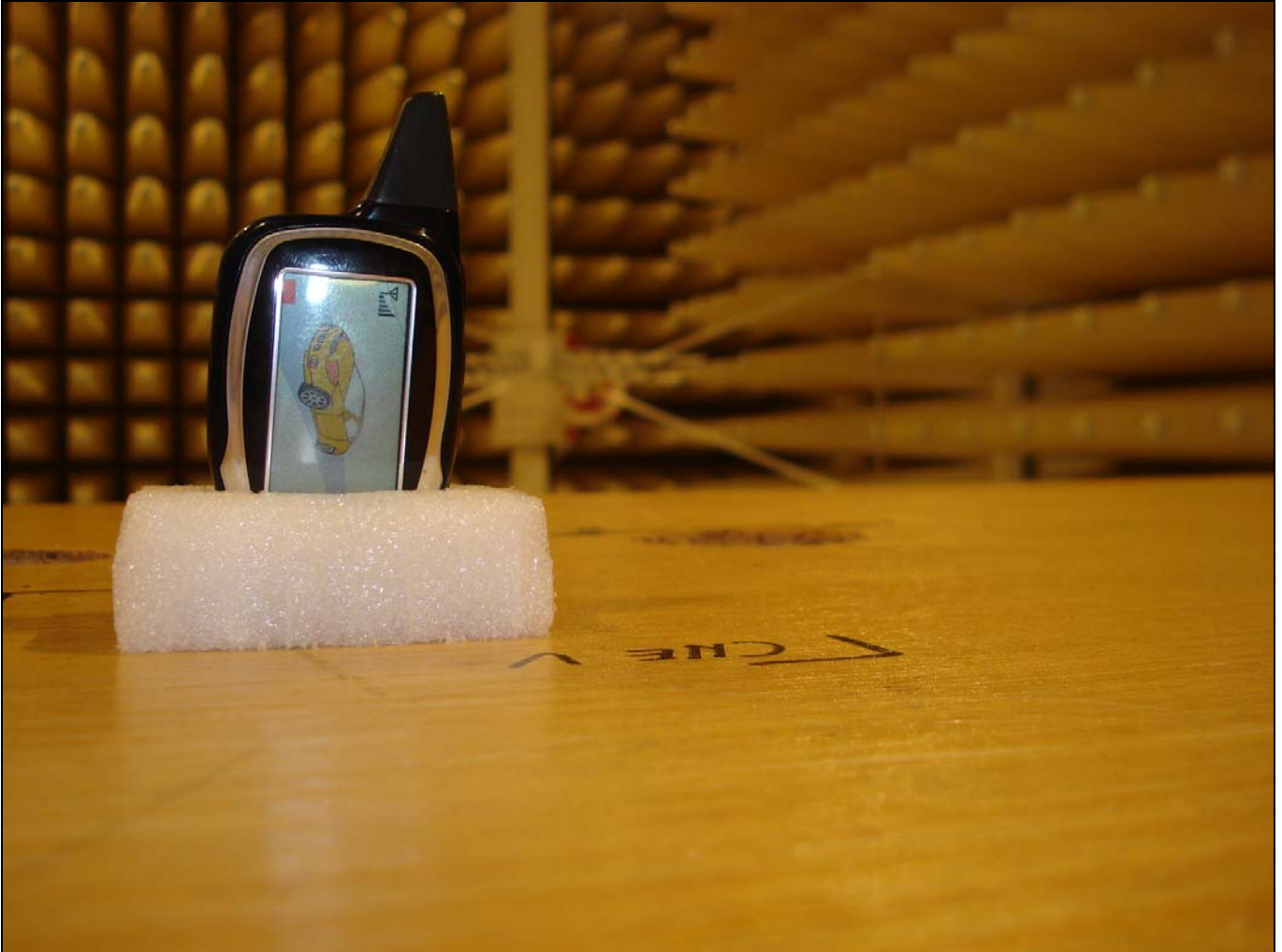
– Test setup photo –