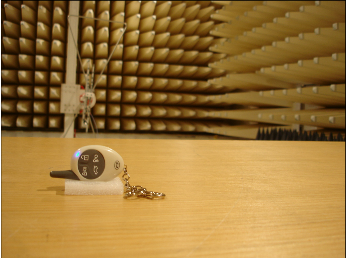
– Test setup photo –