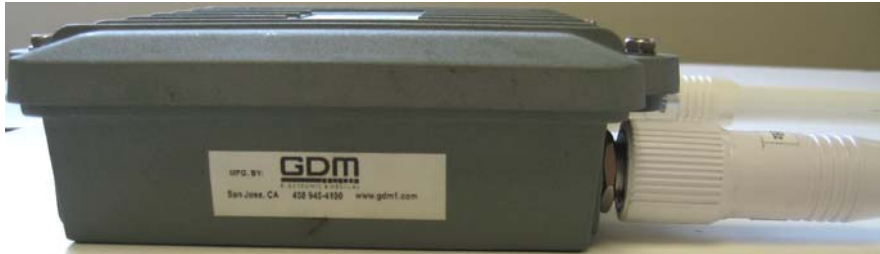
Figure #4: PMX 3.0 External View Side