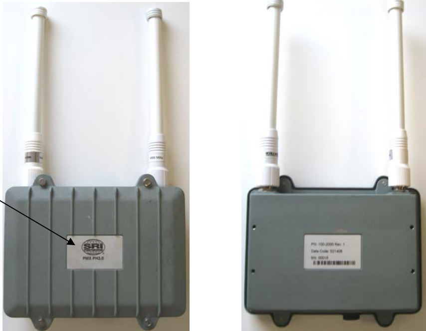
Figure #2: PMX 3.0 External View Front and Back (6dBi antenna configuration) with FCC Compliance label location