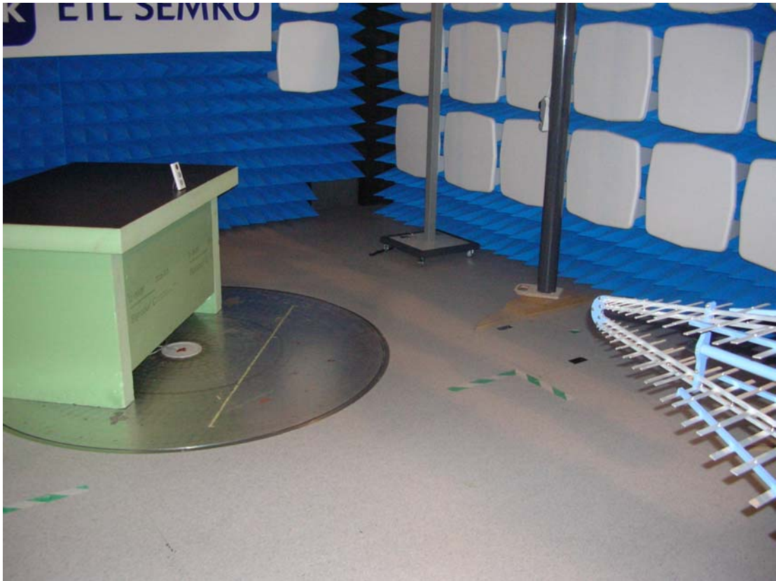
Radiated spurious emission 30-1000 MHz