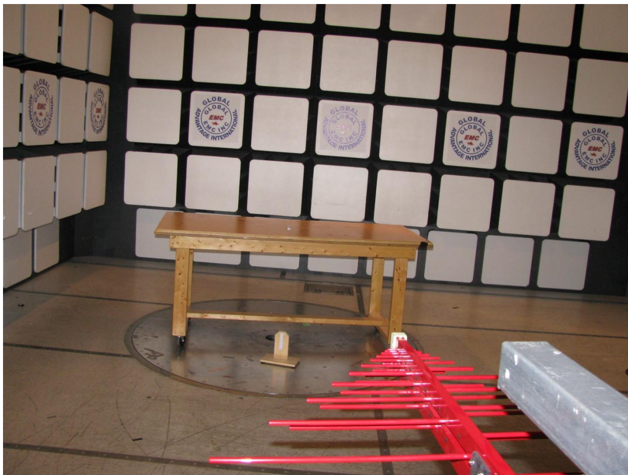
Figure 1 – Radiated emissions