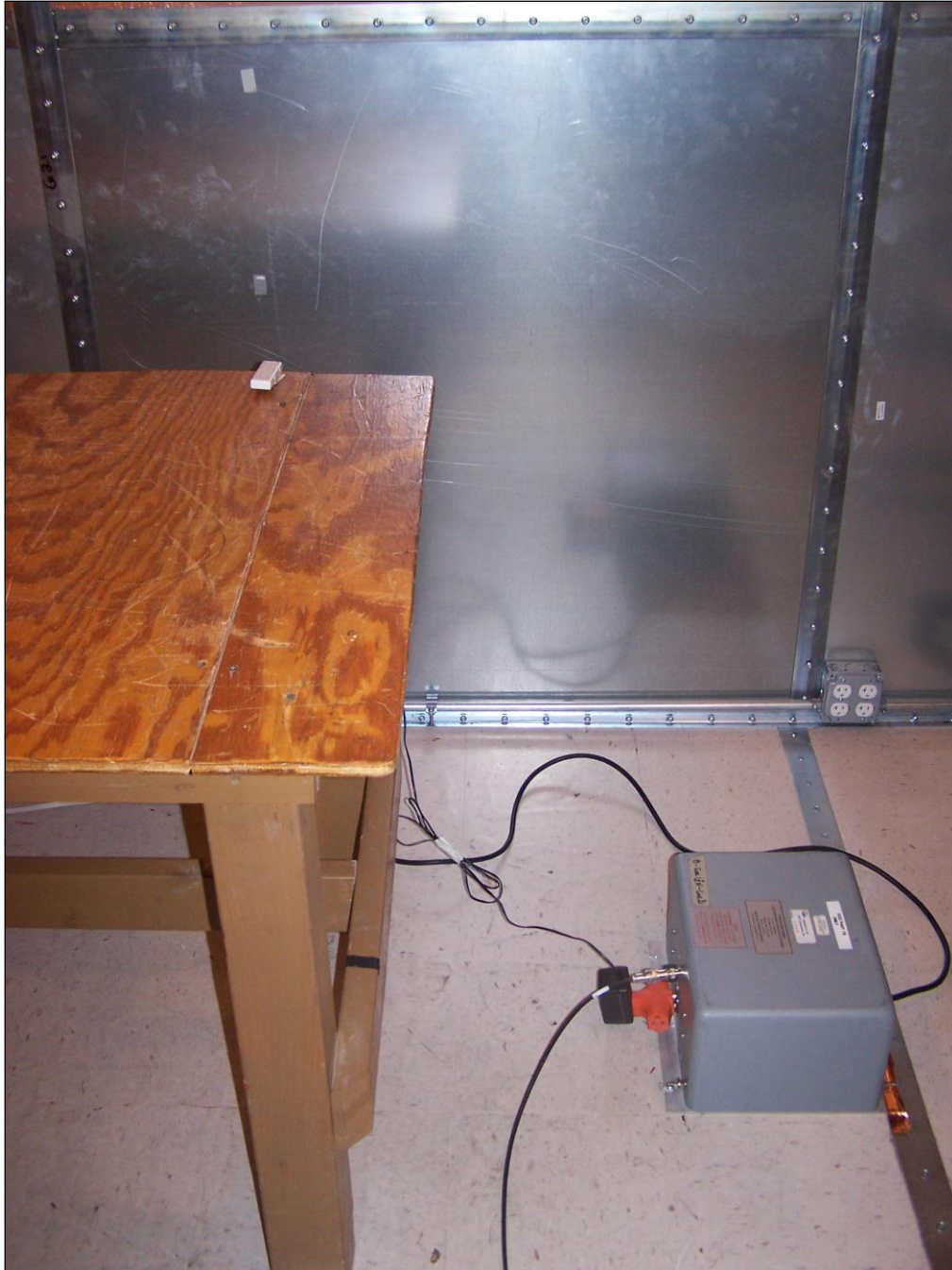
Photograph 3. Conducted Emissions, 15.207(a), Test Setup