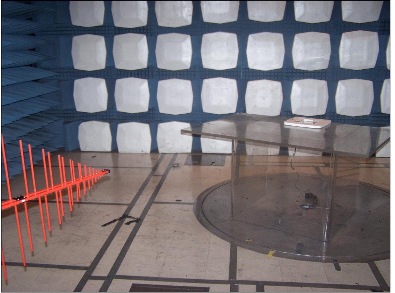
Photograph 2. Radiated Emissions, Test Setup