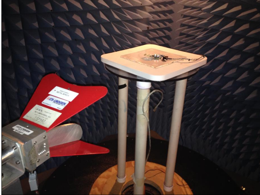
Photograph 4. Radiated Spurious Emissions, Test Setup, Integral Antenna, 1 GHz – 18 GHz at 0.5m Distance