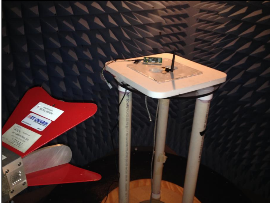
Photograph 6. Radiated Spurious Emissions, Test Setup, External Whip Antenna, 1 GHz – 18 GHz at 0.5m Distance