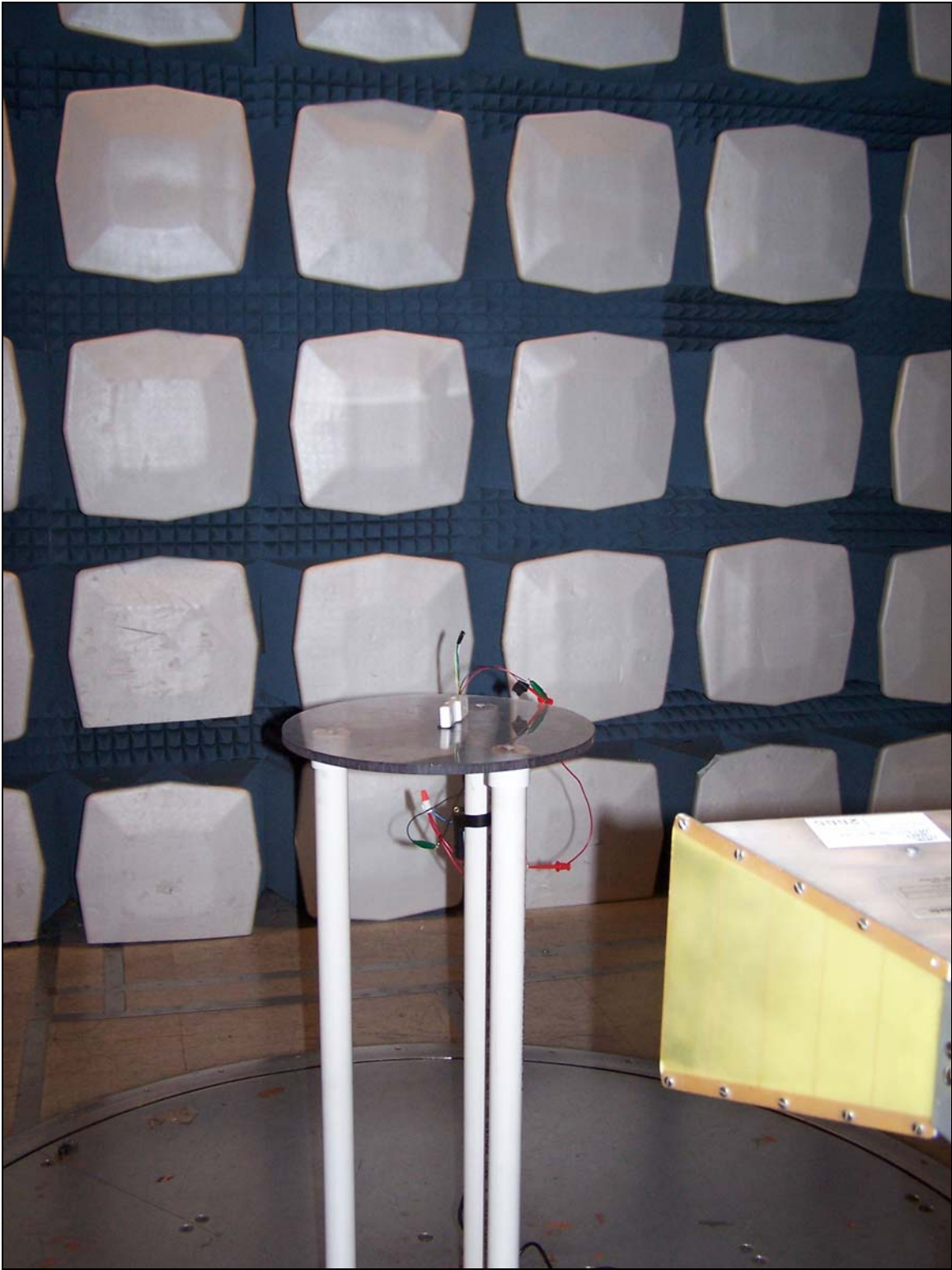
Radiated Spurious Emissions