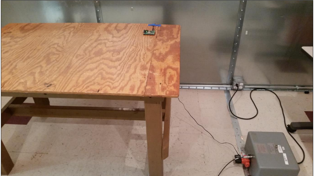
Photograph 3. Conducted Emissions, 15.207(a), Test Setup