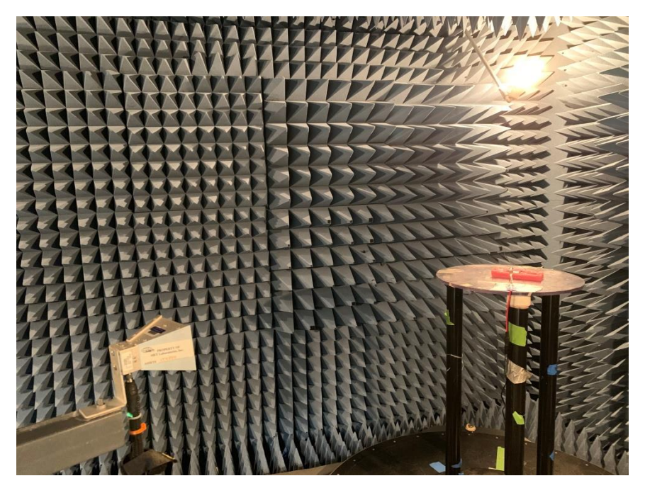
Figure 4: Radiated Spurious Emissions, 18 GHz – 25 GHz, Test Setup