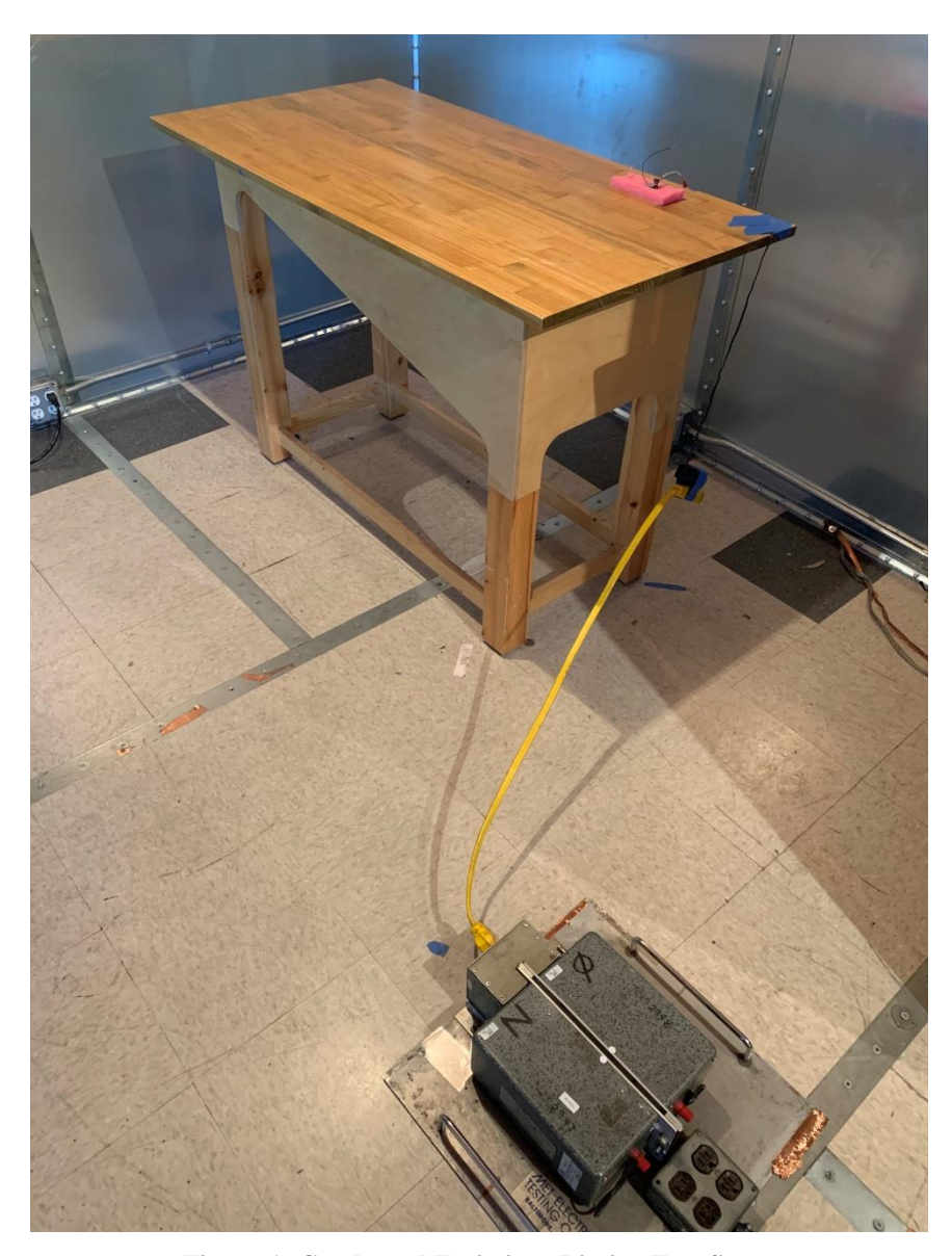
Figure 1: Conducted Emissions Limits, Test Setup