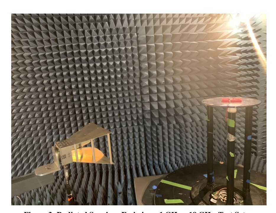
Figure 3: Radiated Spurious Emissions, 1 GHz – 18 GHz, Test Setup