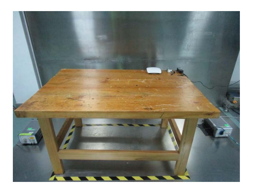
Conducted\ Emissions-Side\ View