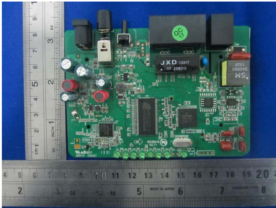
EUT- Main Board Bottom View